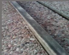
No Tire Marks