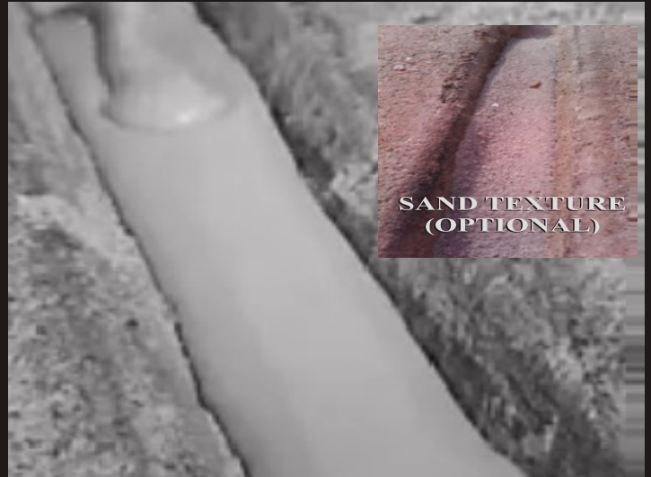
SAND TEXTURE (OPTIONAL)

Simply the best, fastest, easiest to install immediate use expansion joint material